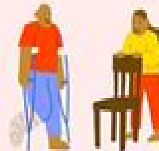
7. Using manners