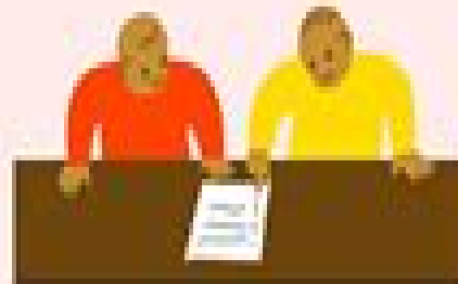
4. Following directions