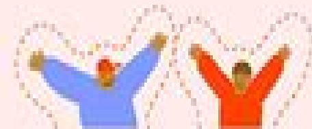
5. Respecting personal space