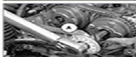
Detailed engine service, including VANOS camshaft timing adjustment N12 Camshaft Timing Chain