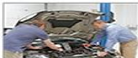
Bentley technical writers testing fuel pump on the Cooper S engine.

Though the do-it-yourself MINI owner will find this manual indispensable as a source of detailed maintenance and repair information, the owner who has no intention of working on his or her car will find that reading and owning this manual makes it possible to discuss repairs more intelligently with a professional technician.