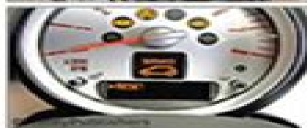
Step-by-step instructions for resetting CBS service items, ECU Maintenance