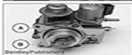
High pressure fuel system service on turbo engine, including replacing in-fuel pump, 550 Fuel Tank and Fuel Pump