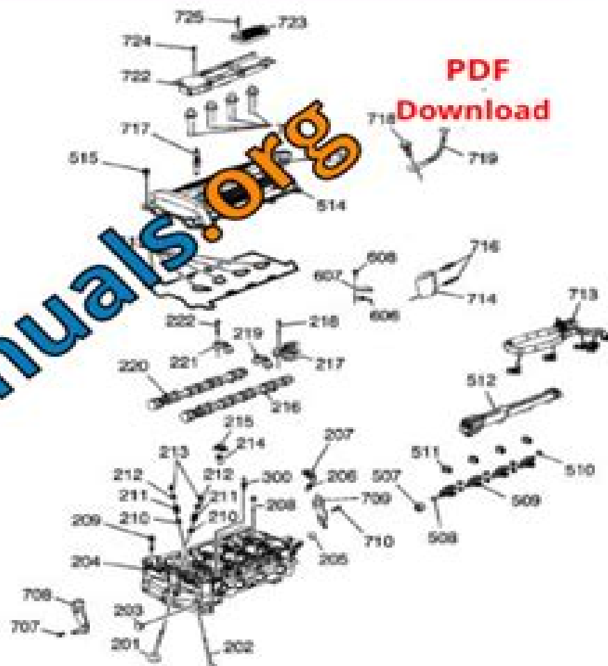
Fig. 18: Disassembled View Of Cylinder Head and Components

Disconnect the electrical harness clips at the bottom of the manifold.