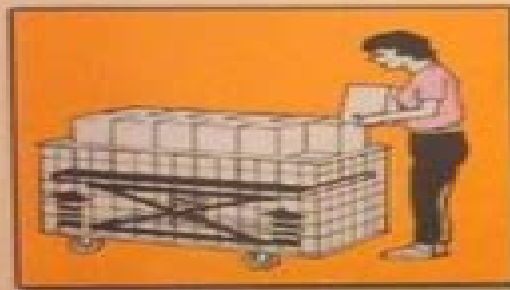
◀ SPRINGS DOLLIES ▶