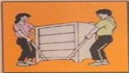
◀ STRAPS TROLLEYS ▶