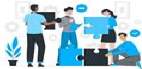
Participation in the Campaigns