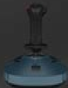
TCA SIDE STICK X COPILOT