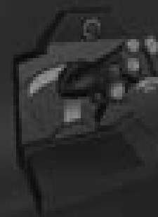
F-16C VAPER TQS