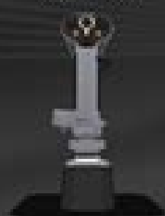
AVA [X] SOL R