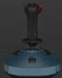
TCA SIDE STICK X PILOT