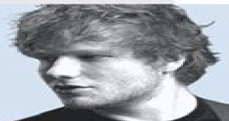
Ed Sheeran GBR