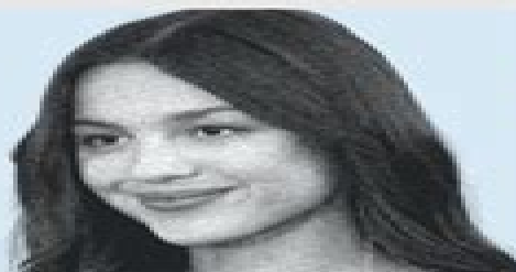
Olivia Rodrigo USA