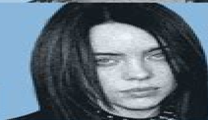
Billie Eilish USA