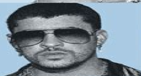
Benito M. Ocasio Bad Bunny