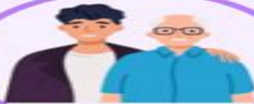
Family & Friends