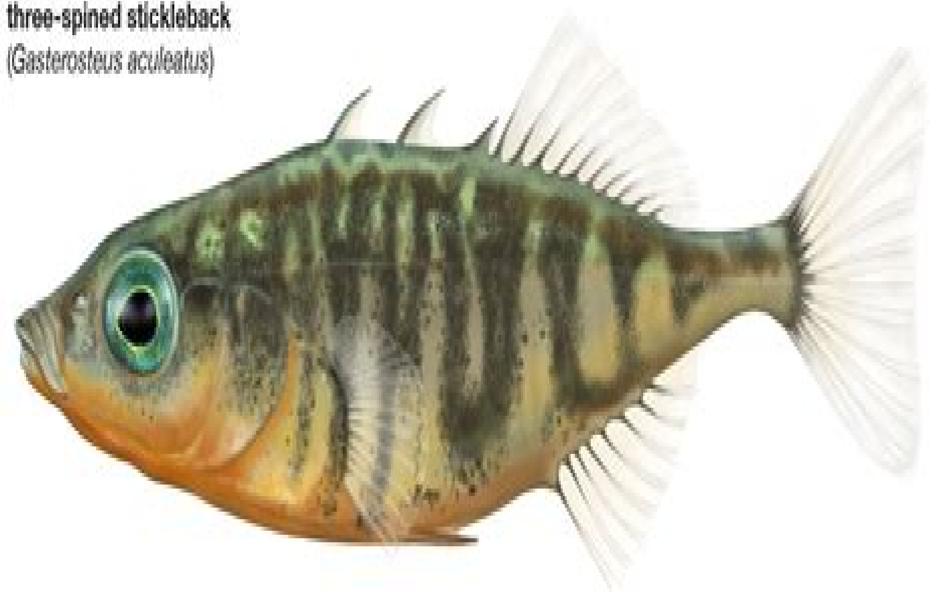
three-spined stickleback ( Gasterosteus aculeatus )