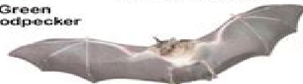
Greater Horseshoe Bat