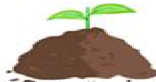
PILE OF DIRT