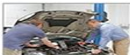
Bentley technical writers testing fuel pump on the Cooper S engine.

Though the do-it-yourself MINI owner will find this manual indispensable as a source of detailed maintenance and repair information, the owner who has no intention of working on his or her car will find that reading and owning this manual makes it possible to discuss repairs more intelligently with a professional technician.