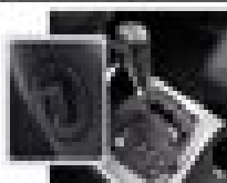
708 JOURNAL OF DOCUMENTATION

The TCU communicates with TCU (Transmission Control Unit), ECU, ESP+ECU and Instrument Cluster to let the driver select the desired transmission gear and to maintain the desired driving condition. Also, the tip switch is installed on the lever knob and the steering wheel so that the driver select the gear manually when the shift lever is in "N".