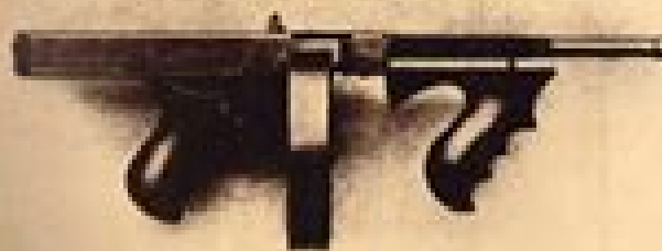
General John T. Thompson and the Thompson submachine gun