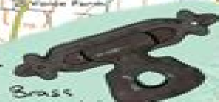
Brass bon catch 1900-1970