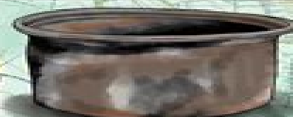
Malvernian jar . 1220-1500