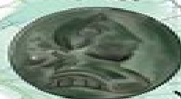
Counterfeit George III halfpenny 1770-1806