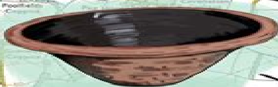
Earthenware pancheon 1700-1800