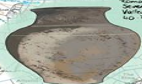
Roman Severn Valley ware 40-500