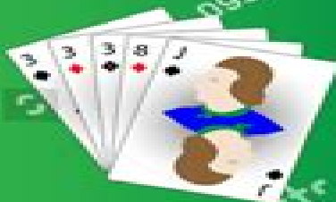
THREE OF KIND