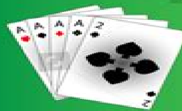
FOUR OF KIND