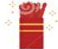
CHI CHI STICKS