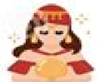
GYPSY FORTUNE TELLER