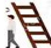
WALKING UNDER A LADDER