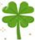
FOUR LEAF CLOVER