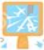
BREAKING A MIRROR