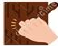
KNOCK ON WOOD