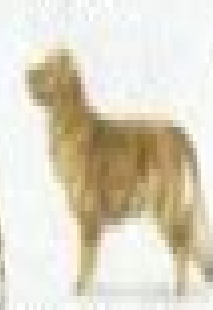
Nova Scotia Duck Tolling Retriever