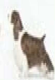
English Springer Spaniel