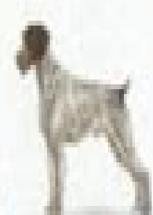
German Wirehaired Pointer