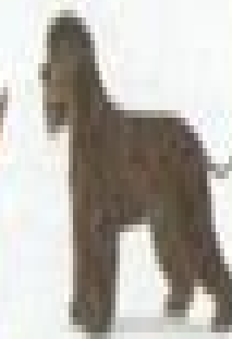
Irish Water Spaniel