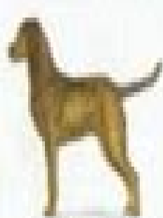
Chesapeake Bay Retriever