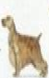
English Cocker Spaniel