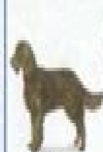
American Water Spaniel