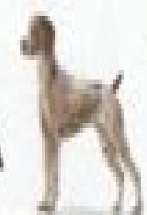
German Shorthaired Pointer