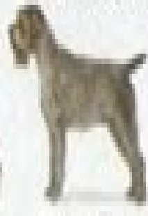
Wirehaired Pointing Griffon