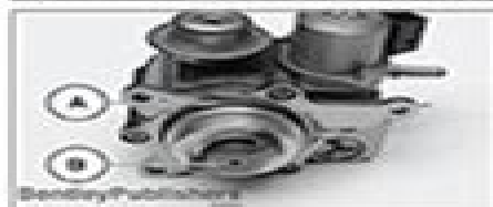
High pressure fuel system service on turbo engine, including replacing in-fuel pump, 550 Fuel Tank and Fuel Pump