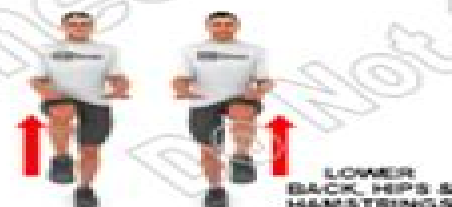
LOWER BACK, HIPs & HAMSTRINGS