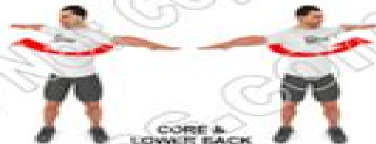
CORE & LOWER BACK