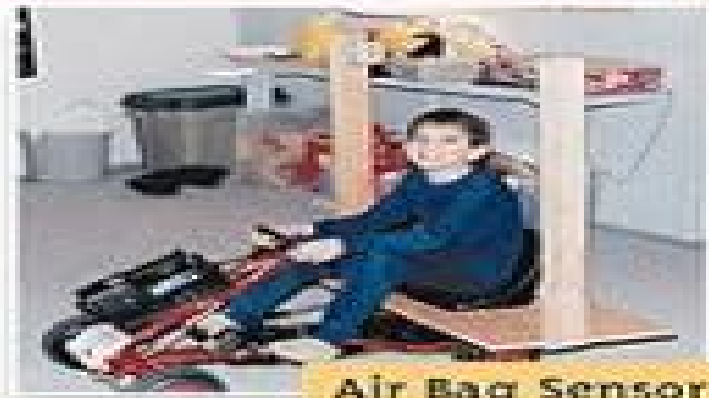
Air Bag Sensor