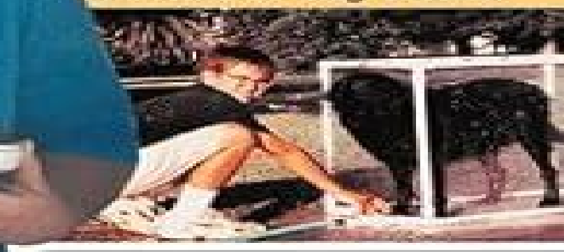
Automatic Dog Washer