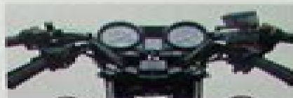
Independent adjustable handlebars designed to suit your riding style. They can be moved vertically and horizontally to a position that suits your taste and riding style.

story. This engine also has a reputation for reliability. The result of over a decade of building and racing four-cylinder engines. It features a maintenance-free transmission and ignition and its overall design makes it easy to work on.