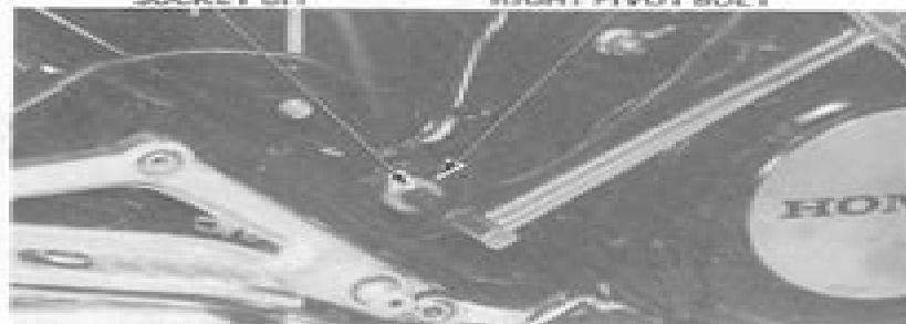
RIGHT PIVOT BOLT

Tighten the lock nut while holding the right pivot bolt.