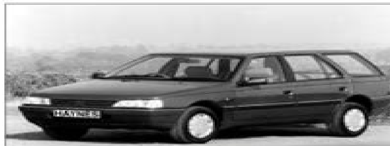
Peugeot 405 GL Estate