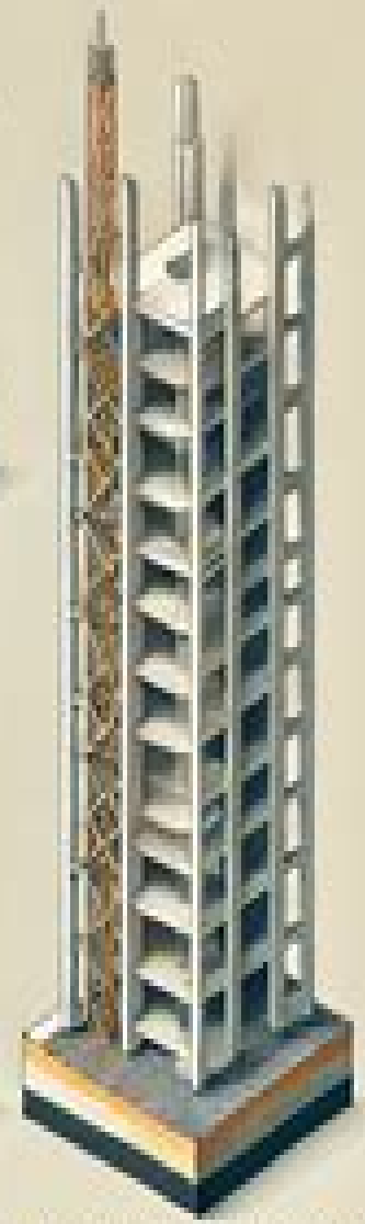
DRILLED FOUNDATION (DRILLED CASTING)