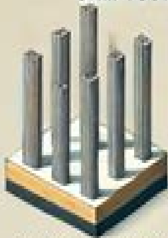
PILED FOUNDATION (SHALLOW FOUNDATION)