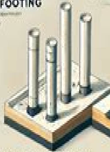
PILE FOUNDATION (SHALLOW FOUNDATION)