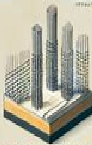
RAFT FOUNDATION (SHALLOW FOUNDATION)