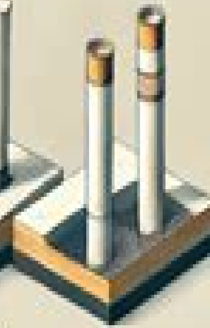
PILE (DRILLED CASTING)