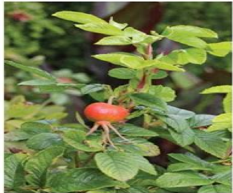
Rosehips add interest and colour to late summer gardens.