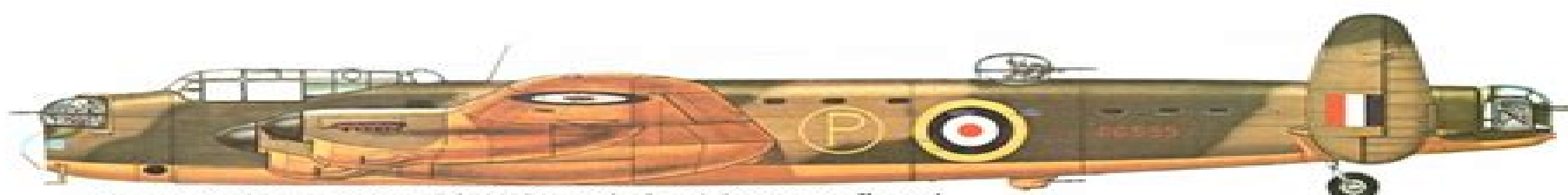
Second Prototype Lancaster, DG595, in standard prototype camouflage at Boscombe Down. Note ventral turret fitting.