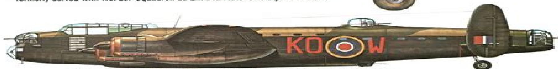
KO-W D5620, a Lancaster B. Mk II of 115 Squadron with bulged bomb bay doors.