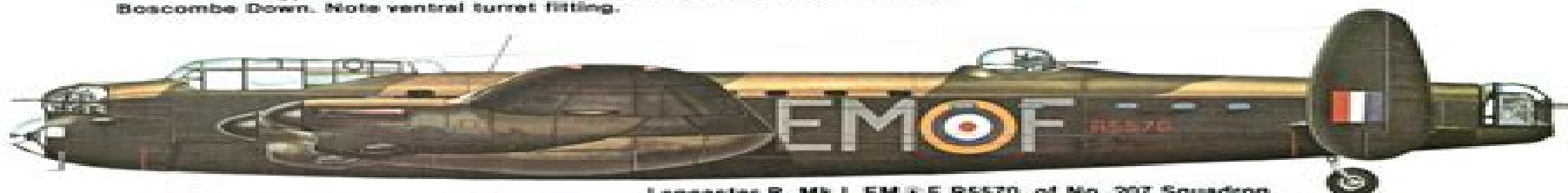
Lancaster B. Mk I, EM-F R5570, of No. 207 Squadron.