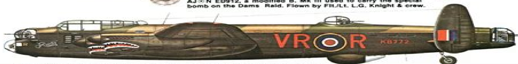
Roney, VR-R KB772, a veteran Lancaster B. Mk X of No. 419 'Moose' Squadron. Roney had shark's teeth and eyes on all four engine nacelles.