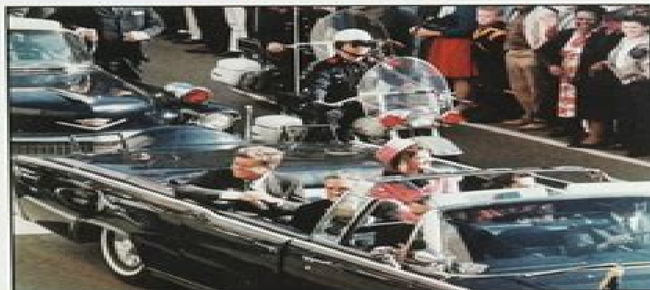
Forensic analysis of the hours that shaped history.

From the tragedies of history to the triumphs of scientific development, this series spans centuries and continents with one common thread: On each of these days, the lives of millions were changed forever. Incredible breakthroughs, acts of shocking brutality, and stories of hope form the themes of these compelling programs. Moments such as the liberation of Nelson Mandela, the assassination of Martin Luther King Jr., the moon landings, the attack on Pearl Harbor, the first nuclear reaction, and the fall of the Berlin wall, are examined through dramatic reconstruction, eye-witness accounts and archive footage, bringing them alive for young and old to relive or to discover for the first time.