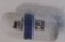
Retrovir 100 mg