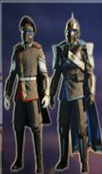
M-1885 PARADE OUTFITTER