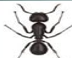
Dark Rover Ant