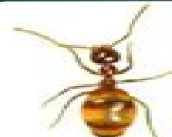
Small Honey Ant