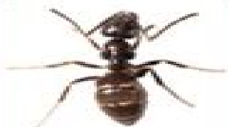
Odorous House Ant