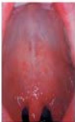
Patient who presented with Koplik's spots on palate due to pre-eruptive measles on day 3 of illness