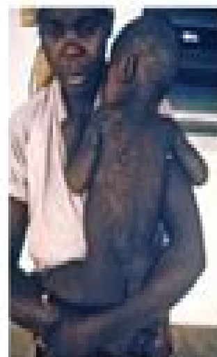
Skin sloughing off of a child healing from measles infection