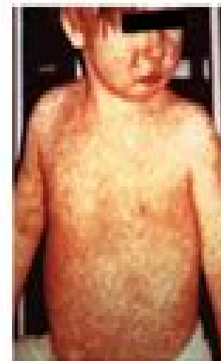
Child with measles rash after 4 days