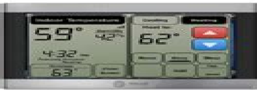
Wireless Zone Sensor with Display