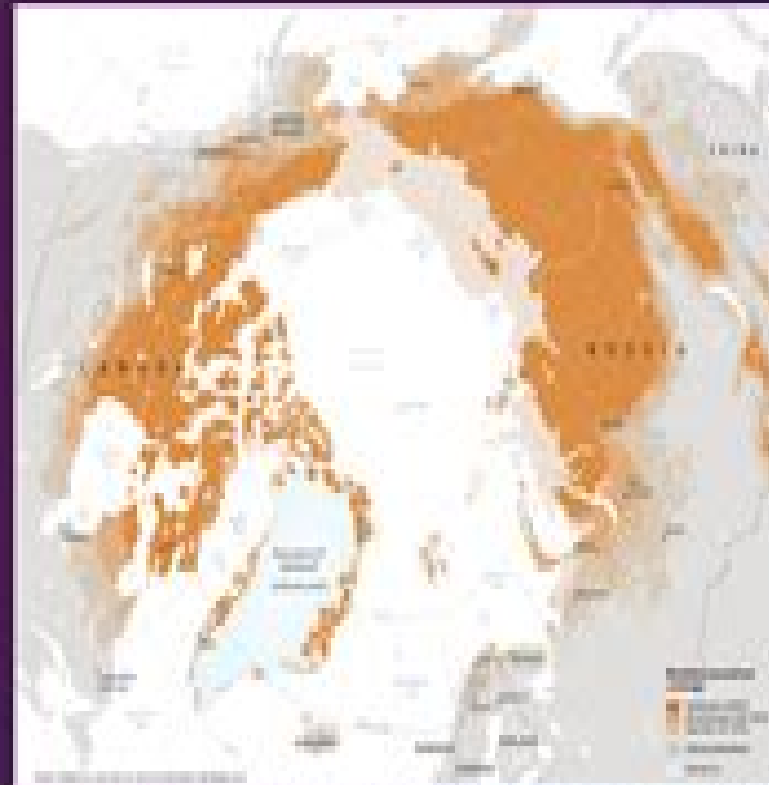
Permafrost, defined as ground that has been frozen for at least two years, is mainly found in Earth's coldest regions. The orange areas on this map show the extent of permafrost coverage in the Arctic.