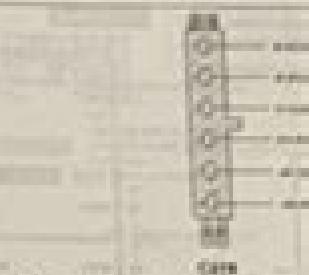
CLUSTER PEDAL POSITION (CPP) SENSOR