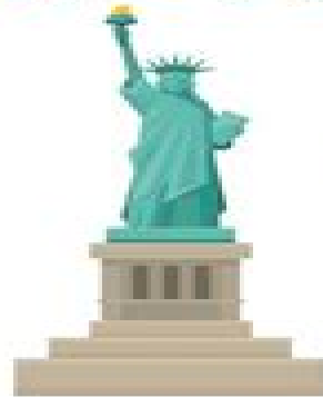
Statue of Liberty