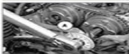
Detailed engine service, including VANOS camshaft timing adjustment, N12 Camshaft Timing Check