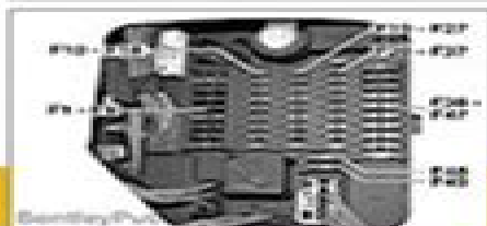
Comprehensive fuse, relay, and electrical component locations, ECI Electrical Component Locations