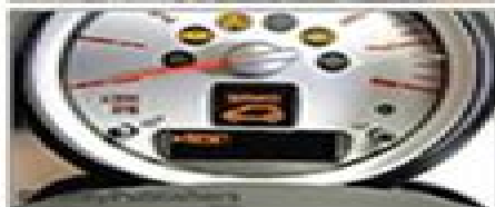
Step-by-step instructions for resetting CO2 service items, E20 Maintenance