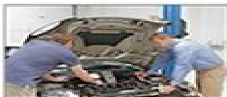
Bentley technical authors testing fuel pump on the Cooper S engine.

Though the do-it-yourself MINI owner will find this manual indispensable as a source of detailed maintenance and repair information, the owner who has no intention of working on his or her car will find that reading and owning this manual makes it possible to discuss repairs more intelligently with a professional technician.