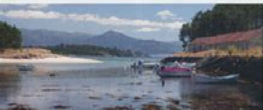
Bay de Cíes, Galicia