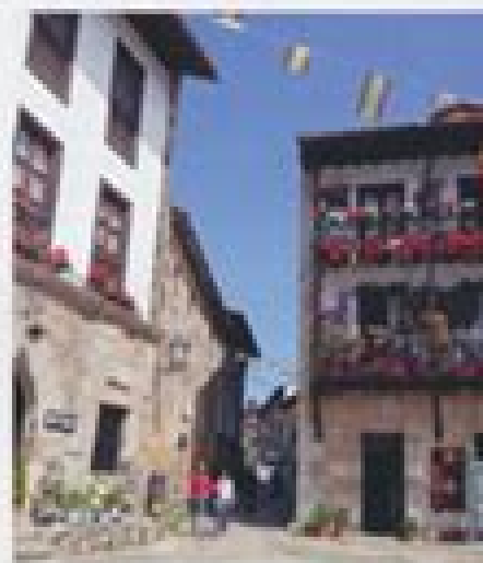
Santillana del Mar

Alcalá del Júcar (Murcian) Spectacularly sited in a gorge with some of its houses excavated deep into the rock of a river meander. See page 133.