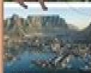
Table Mountain Facts and Highlights