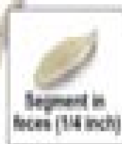
Segment in feces (1/16 inch)