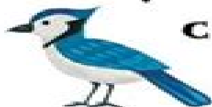
B. Blue Jay