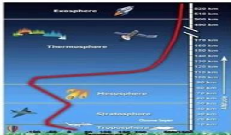
Altitude vs Temperature Graph

I. Directions: Analyze the graph and answer the following questions.