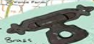
Brass bon catch 1900 - 1970