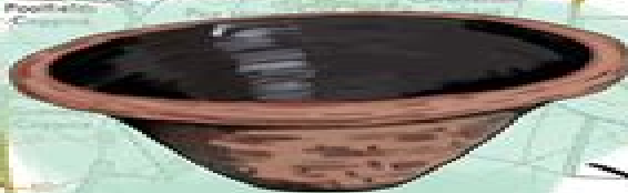
Earthenware pancheon 1700 - 1800