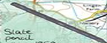
Slate pencil 1700 - 1950