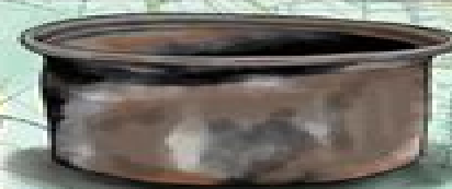
Malvernian jar . 1220 - 1300