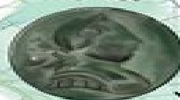
Counterfeit George III halfpenny 1770 - 1806