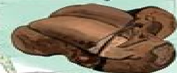
Butchery waste Cattle astragalus