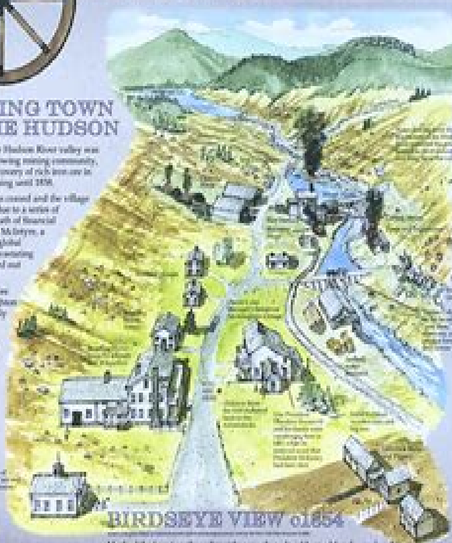
BIRDS EYE VIEW 1854

The building before you, the McNaughton Cottage, is the only wood frame structure that remains from the iron mining era.