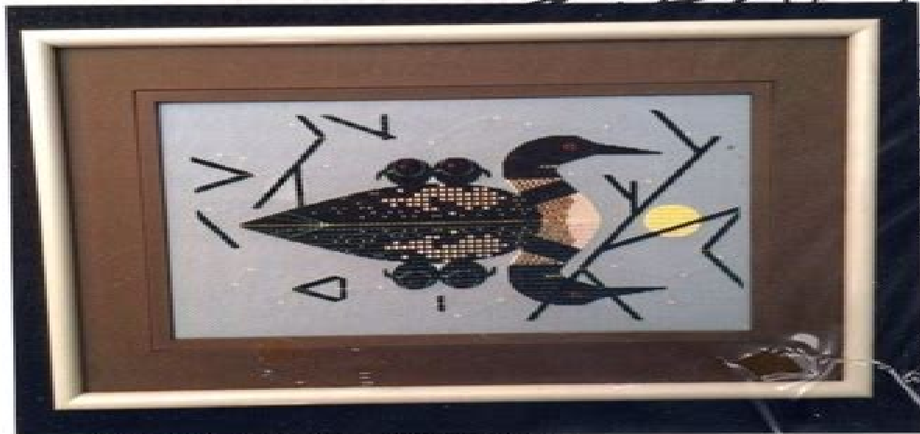
Antennae color choice: wedgewood blue in fabric of choice

der the ours old s and n their ocation d hyste s the r