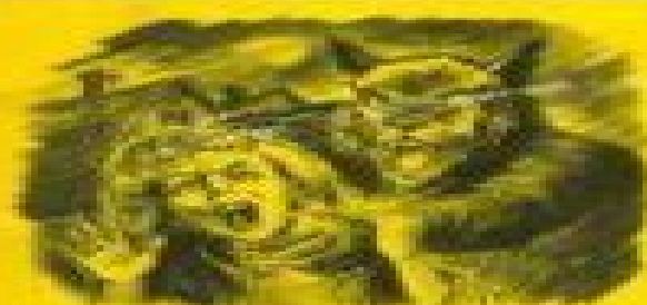
The Wildest Werewolf— he stalks by moonlight.