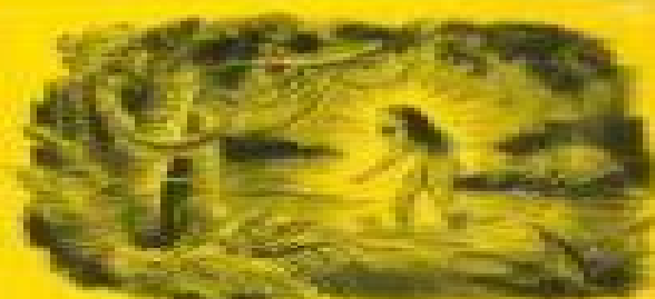
The seductive sorcery of Sangal— men cannot break her spell.