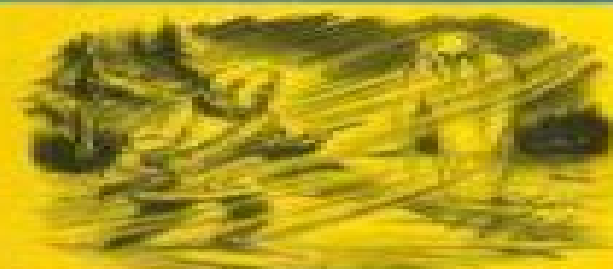
The wrathful wrath—sure death to all who defied him.