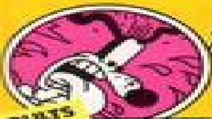
ADULTS ONLY MASSACRE