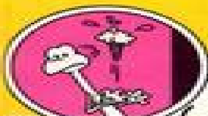
PANIC IN THE CITY

WORLD'S FAVORITE ADVENTURE-STRIP CHARACTER!