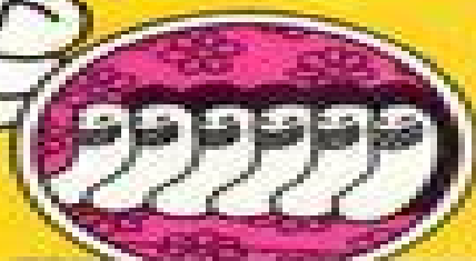
VERY HOT DOGS