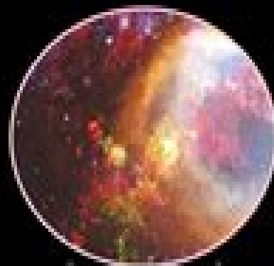
Over billions of years our universe could become filled with the glowing matter that was the Big Bang

Some scientists think that billions of years in the future, the Universe will collapse towards and end in a Big Crunch! But it may not be the end, because other scientists believe that even if there is a Big Crunch it will be followed by another Big Bang and a brand-new Universe will be born.