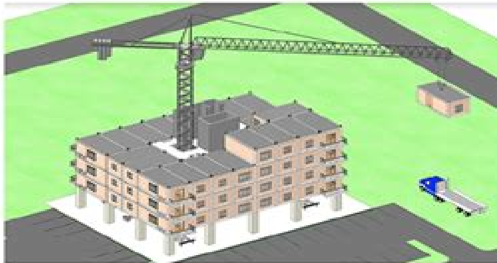
(e) Module lifting and installation at site