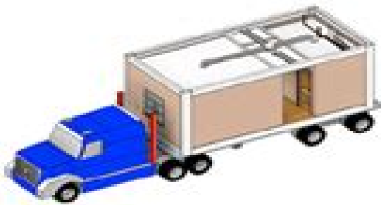
(d) Module transportation to site