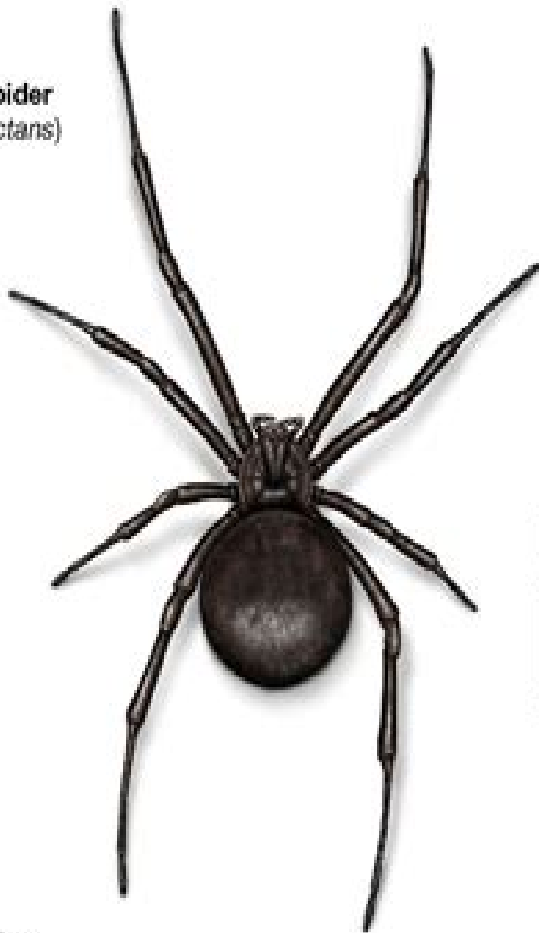
black widow spider ( Latrodectus mactans )